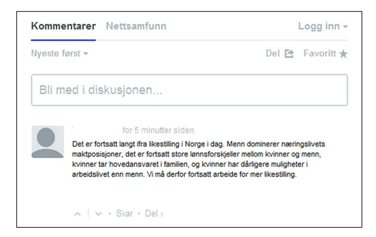
Figure 1. Stimuli was presented in the format of online debates.

gender equality should continue and 10 indicates that gender equality has gone too far, where will you place yourself? Several questions on use of Facebook and then Twitter were asked between the general gender equality question and the experiment. Immediately after the experiment and the follow-up questions (see above), we repeated the general gender equality question.