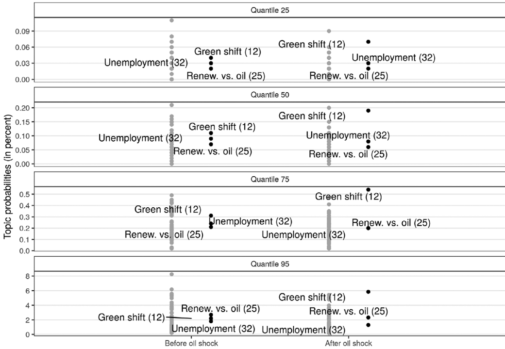
Figure 2. Topic load (%) quantile values before and after oil shock. Grey dots show topics not used in the analyses; black dots show topics used in the analyses.

Figure 2 shows our first important result. The figure plots quantile per cent values for the three selected topics compared to the topics left out of the main analyses. The topic model gives each speech a proportion value according to how much of the speech loads on a given topic, so that the sum proportion for each speech over all topics always equals 1 (or 100 per cent). In other words, the figure shows how much our chosen topics are used by MPs in the two periods compared to all irrelevant topics.